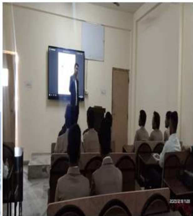
Alumni Conclave In Progress