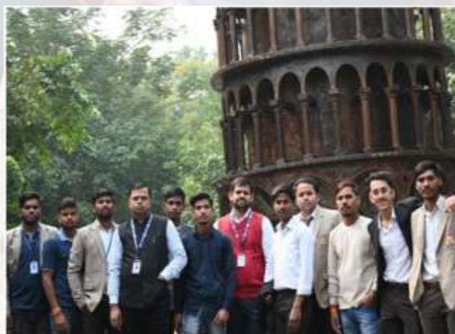
Students at the 'Waste to Wonder Park'