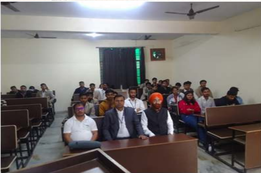
Event On 'make In India' In Progress

The 'Make in India' initiative intends to train 10 million people in diverse sectors in India each year. To make 'Make in India' a reality, the vast human resource needs to be up skilled. This is significant because India's formally skilled workforce accounts for barely 2% of the population. The primary goal behind this initiative is to create an ecosystem that promotes the growth of startups while also driving long-term economic growth and producing large-scale employment.