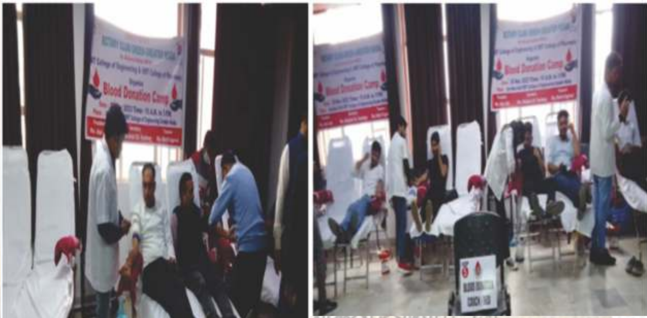
A Glimps Of Blood Donation Camp

The NSS Club of IIMT College of Engineering, Greater Noida organised “Blood donation camp” activity on 30 November, 2023 in association with Imagine Rotary Club, Greater Noida. The objective of a blood donation camp was to promote enthusiasm among people to help their communities by donating blood. Donors were carefully screened at blood donation camps to ensure that their blood was completely risk-free for both the recipient and the donor.