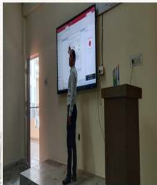
Seminar on Staadpro Software in Progress