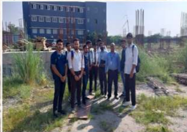
The Industrial Visit in Progress